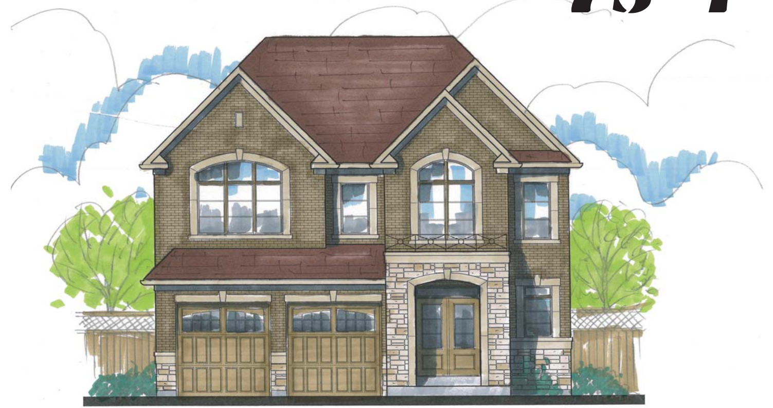
FRONT ELEVATION 3408 SQ.FT.