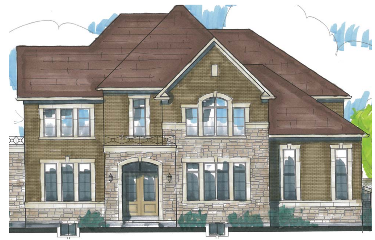
FLANKAGE ELEVATION 3408 SQ.FT.